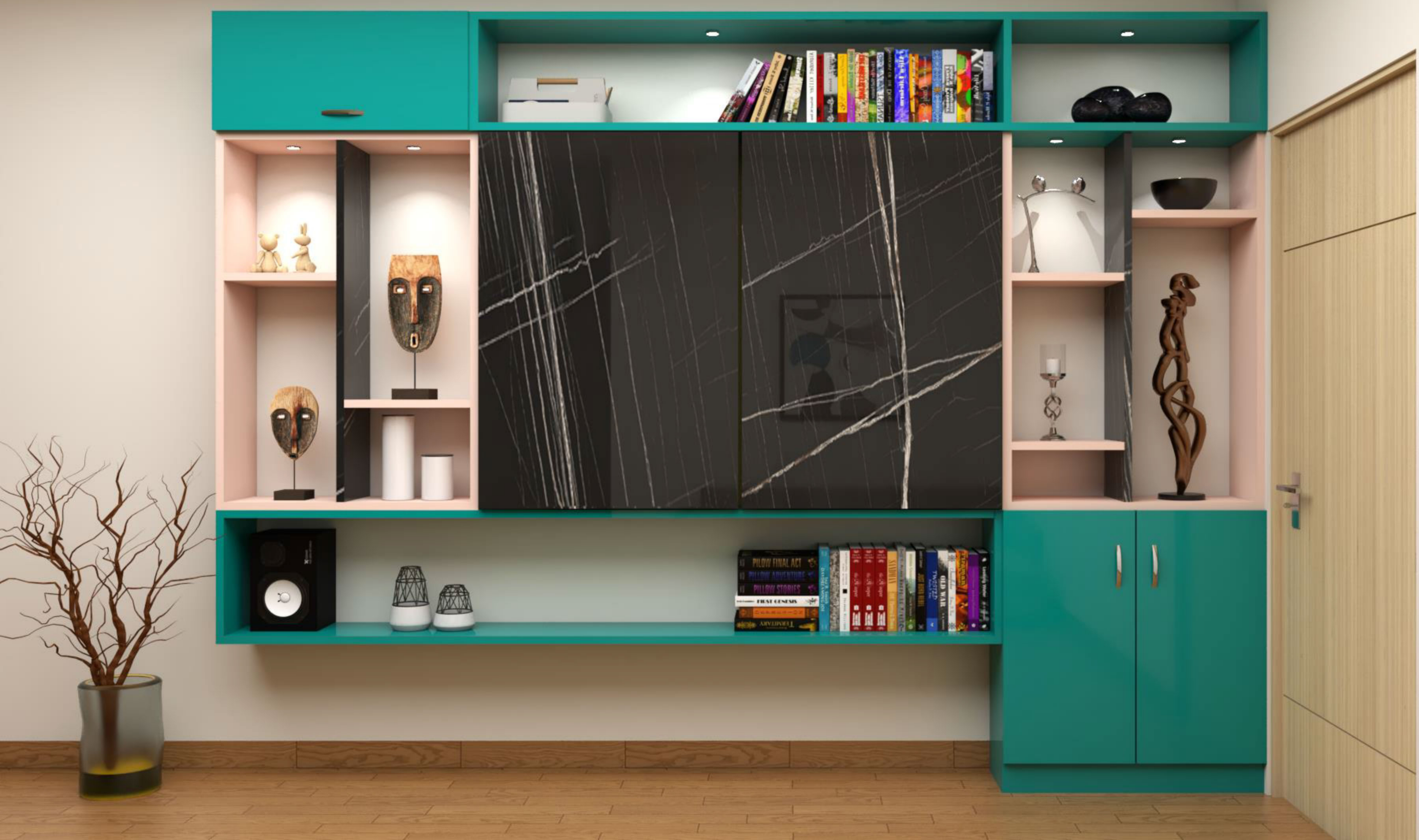
Living area TV unit –Sliding door type